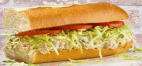
#10 Tuna Fish