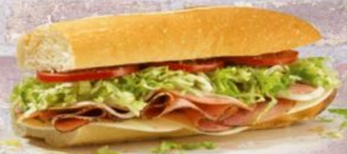
#4 Provolone, prosciuttini and cappacuolo