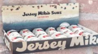
Subs by the box