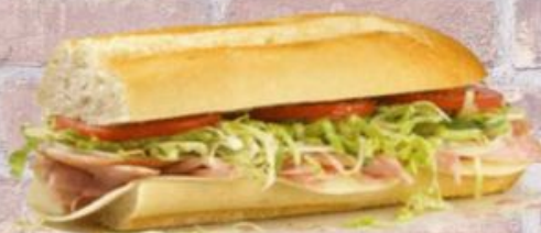
#2 Jersey Shore Favorite